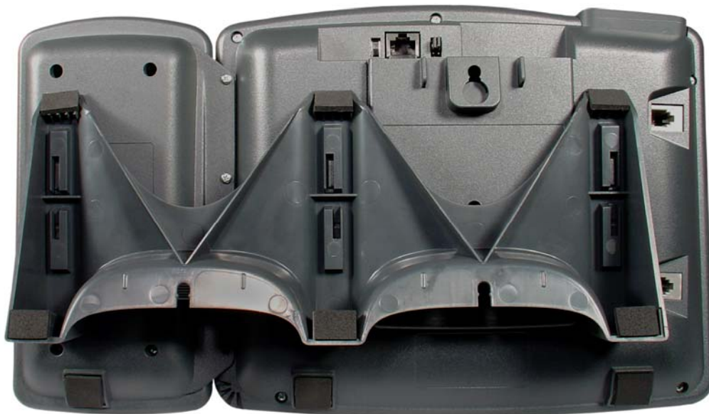
Wall Mount Position