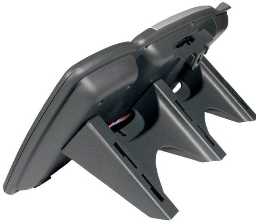
High Desktop Position