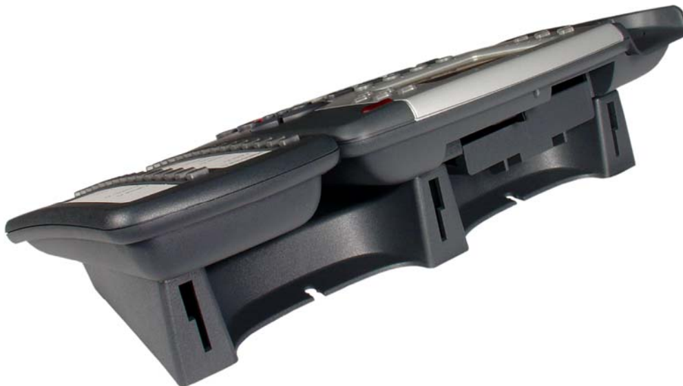
Low Desktop Position